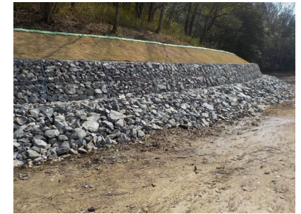
▲ After work Area covered with stone materials