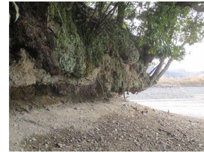
▲ Before work Area where the base of the mound was damaged

December 2025, Akaiwa City Board of Education